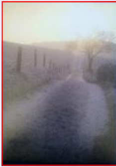
1. 10 of one design

CHRISTMAS CARDS SUPPORT ST. VINCENT'S WHEN BUYING YOUR CHRISTMAS CARDS ST. VINCENT'S IS ACKNOWLEDGED ON ALL CARDS PRICE: €5 PER PACK OF 10 CARDS