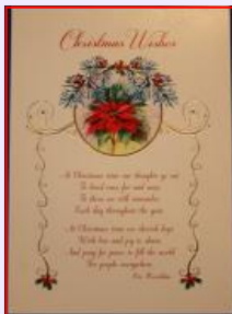
6. 10 of one design