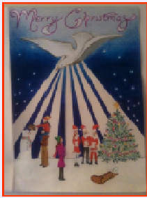
3. 10 of one design