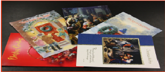
5. Assorted cards