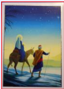
7. 10 of one design